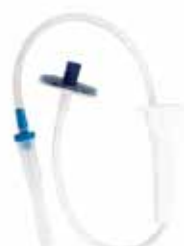
Transfer filtre kit