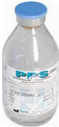
Vacuum citrate glass bottle