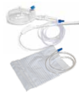
Rectal pump set