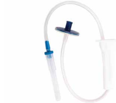
Transfer filtre kit