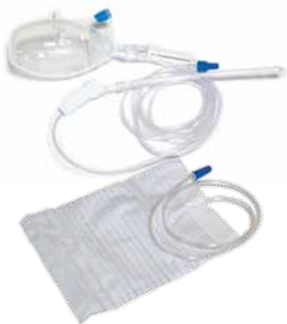
Rectal pump set