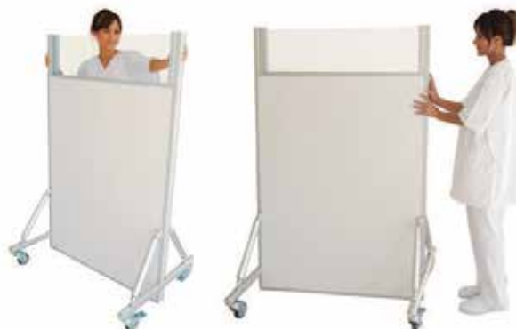
Half Glazed Acrylic Paravane