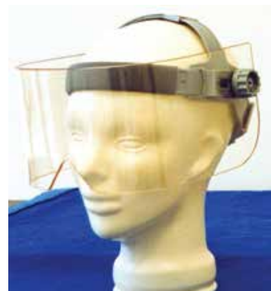
Panoramic Half Protection Mask