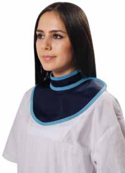
Large Hat Style