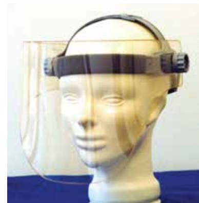
Panoramic Complete Protection Mask