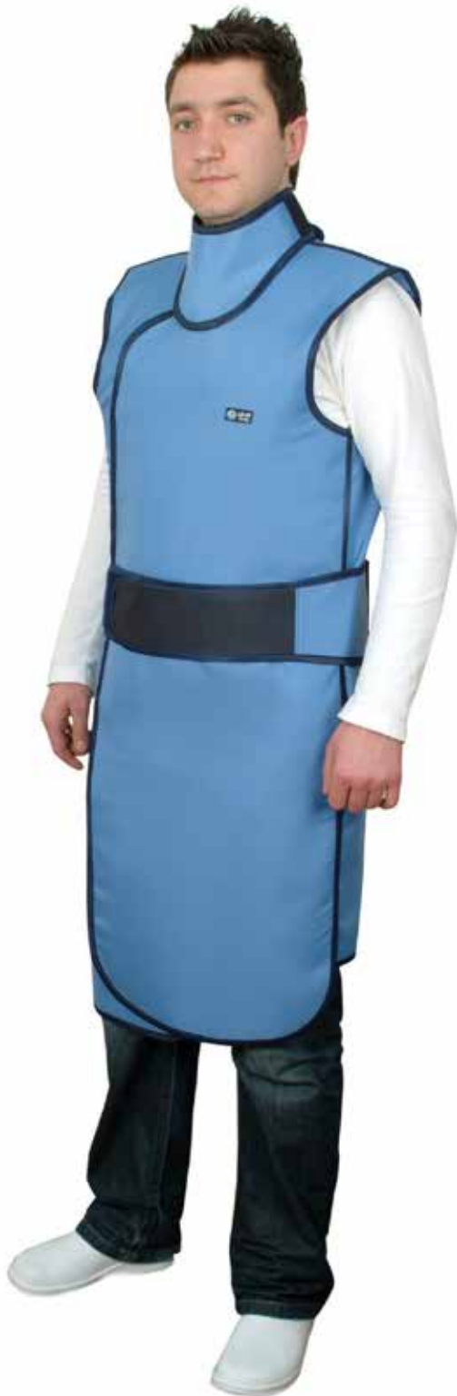
Double Sided Apron with Belt