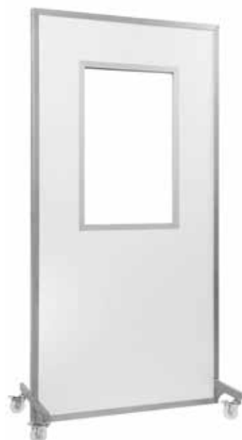
Standard Paravane with Large Glass