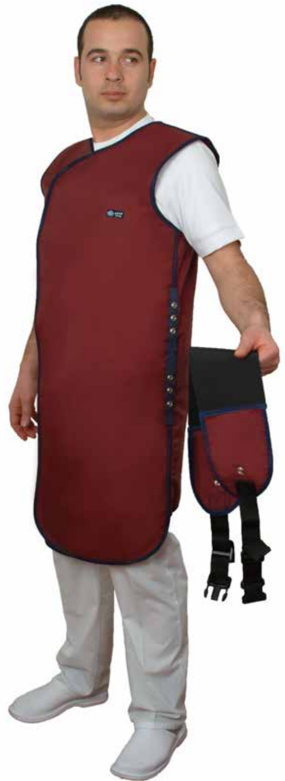
Double Sided Apron with Snap